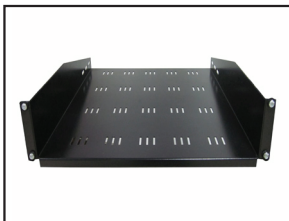
2U cantilever shelf