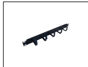
1U cable manager